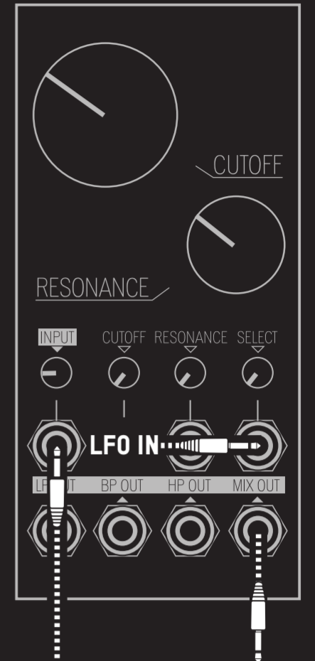
AUDIO IN AUDIO OUT

When using the HI PASS output at a very low cutoff and high resonance, sub bass frequencies are added around the Q frequency.