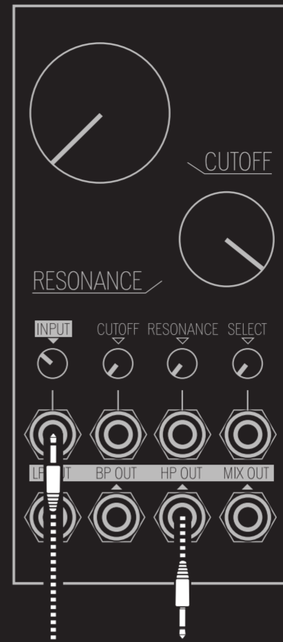
AUDIO IN AUDIO OUT

Patch the HI PASS Audio Output back into the AUDIO Input to create an oscillator.