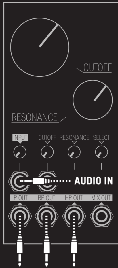
3 OUT TO CHANNEL MIXER

When the input gain is all the way up, the signal is distorted along with high resonance, creating a gritty sound.